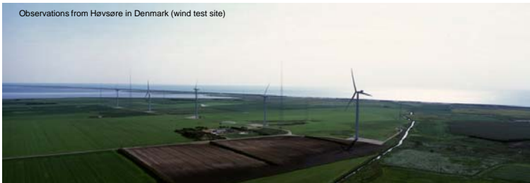
Observations from Høvsøre in Denmark (wind test site)

Non-spherical particles, like ash, will change the polarization. The perpendicular returned scatter enables us to discriminate between spherical and non-spherical particles, e.g. aqueous versus silicate particles as pollutants. The bottom range (the first kilometer) shows the atmospheric boundary layer backscatter structures. As seen there is significant amounts of aerosols and dust here. The brown "blobs" are clouds which are sometimes so dense that they are impenetrable to the laser light (white background). The blue background stems from scattering from the atmospheric molecules. The "sinking" cloud which is evident from about the afternoon on 19 April until the following morning (red circles) has been confirmed independently by the Danish Meteorological Institute (DMI) as being the ash cloud. On the 22 April, DMI predicted the return of the ash plume over Høvsøre. This is confirmed by the blocking of the perpendicular backscatter signals in the middle lower panel (cf. inserted red squares frames).